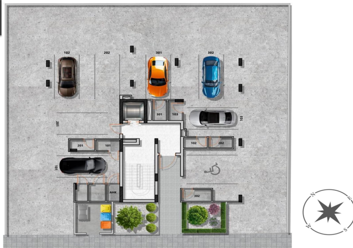
GROUND FLOOR PARKING & STORAGE