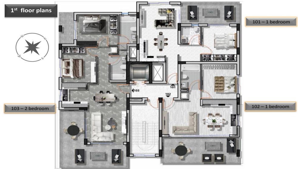
1 ST FLOOR PLANS – 1- & 2-BEDROOM APARTMENTS