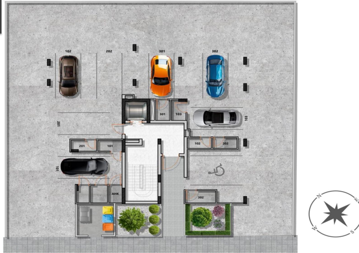
GROUND FLOOR PARKING & STORAGE