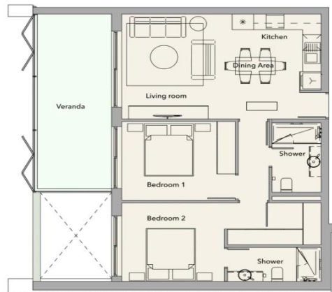
Roof Garden Floor