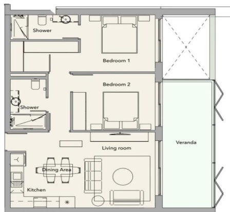
Roof Garden Floor