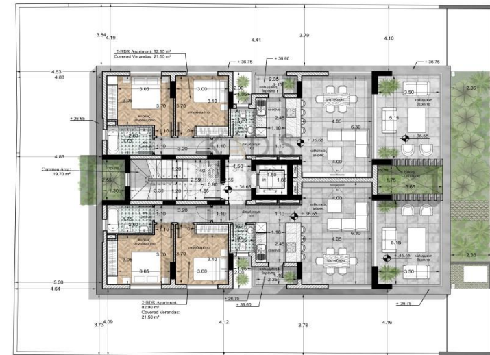
Layout approach 1st Floor / 2nd Floor / 3rd Floor / 4th Floor: 19.70 m 2 (common area) + 82.90 m 2 (2-BDR) = 102.60 m 2 Covered Verandas: 21.50 m 2 (2-BDR) + 21.50 m 2 (2-BDR) = 43.00 m 2 (23.18%)