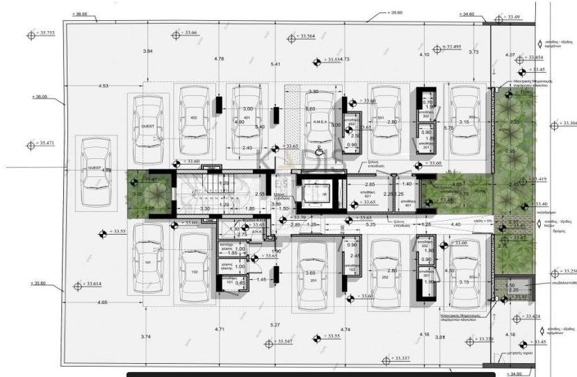
Layout approach Ground Floor: Common entrance, parking lots & storages