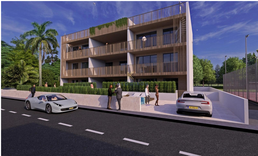
ΔΥΤΙΚΗ ΟΥΨΗ - HOUSE B