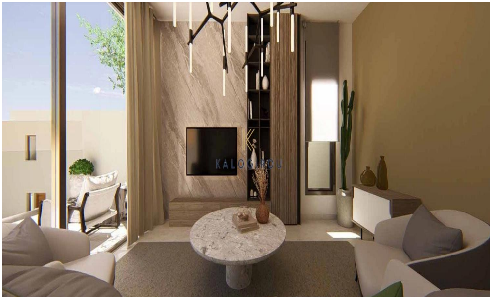
VILLA TYPE A2 / VILLAS 4, 7, 8, 10, 11, 12, 13, 14, 15 3 BEDROOM