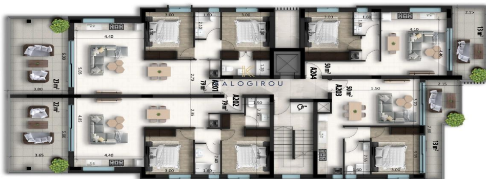
Floor Plan - 2nd Floor