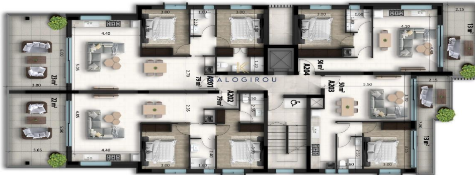
Floor Plan - 2nd Floor