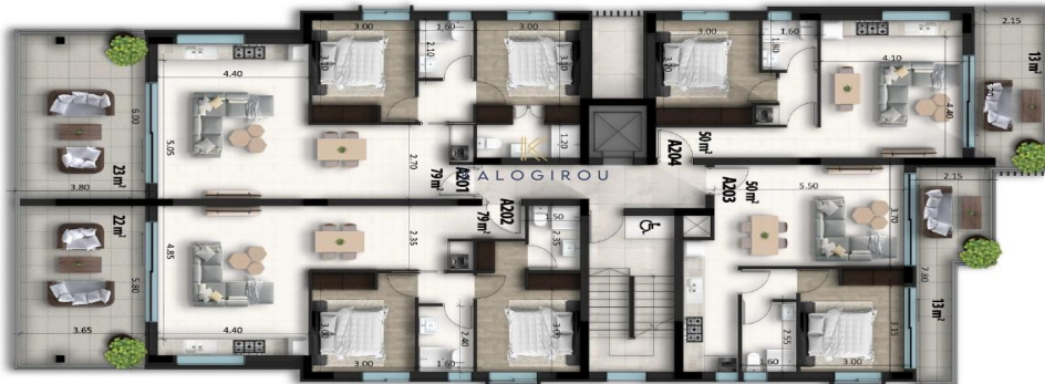
Floor Plan - 2nd Floor