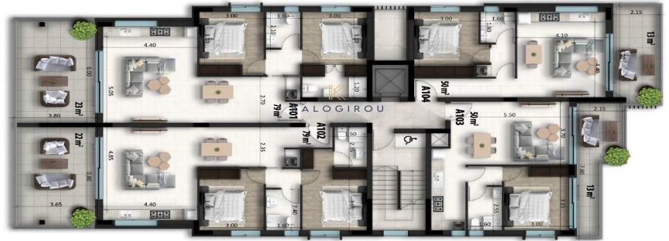
Floor Plan - 1st Floor