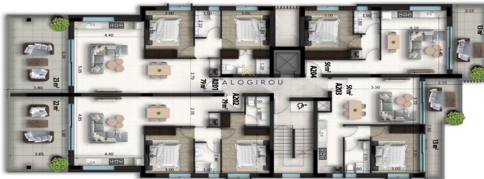
Floor Plan - 2nd Floor