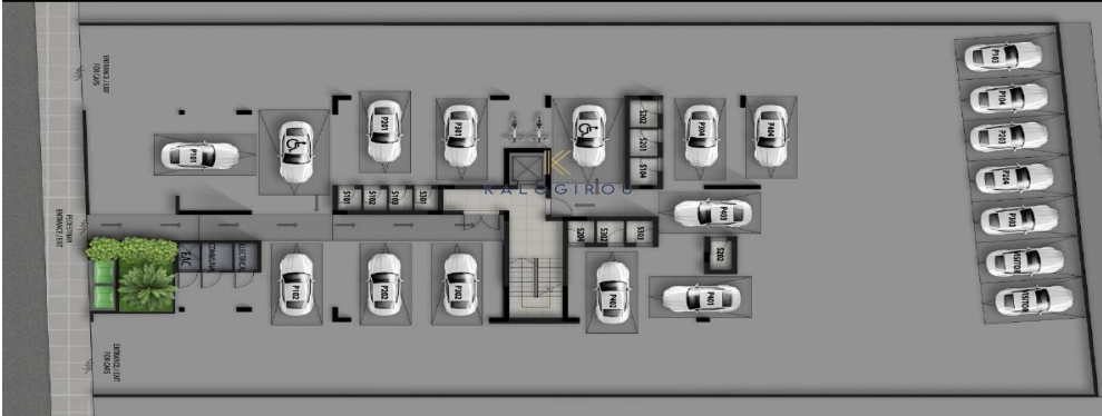
Floor Plan - 1st Floor