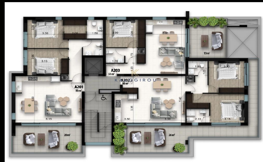
Floor Plan - 2nd Floor