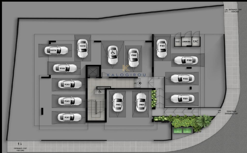
Floor Plan - Ground Floor