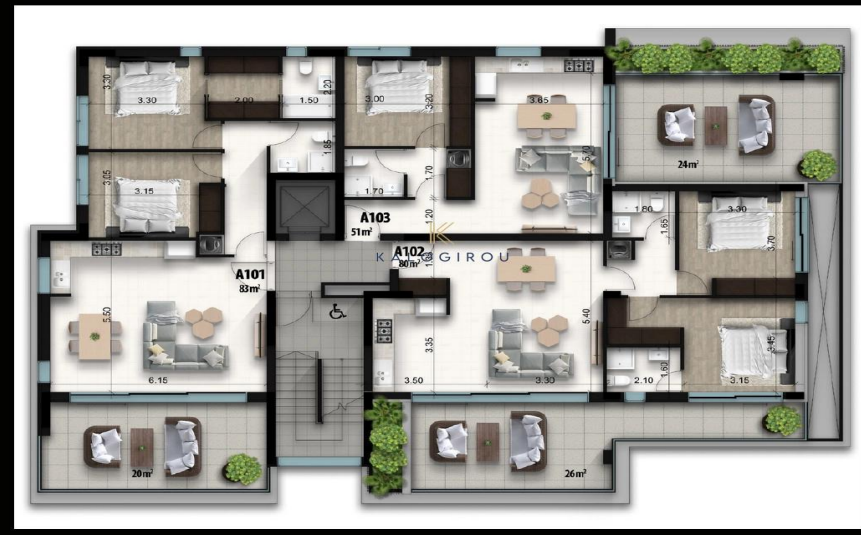
Floor Plan - 2nd Floor