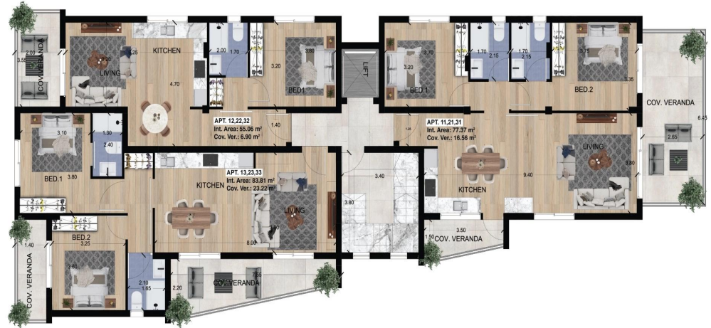
Typical Floor Plan - Block B