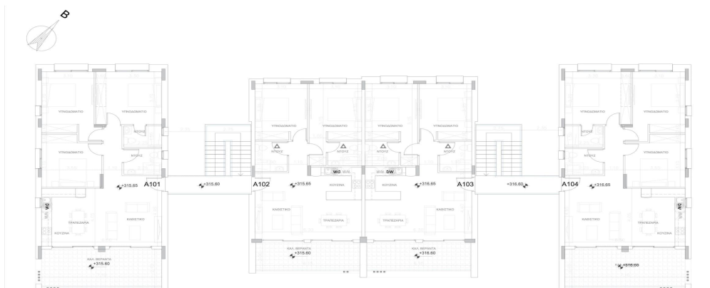
Block A - First floor