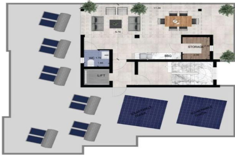
Roof Garden Plan - Block A