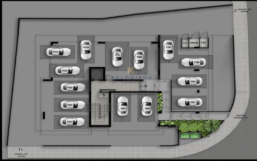
Floor Plan - Ground Floor