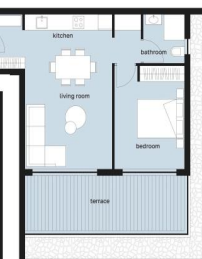
Flats 102/202 Kitchen/Living 33.19m 2 Bedroom 12.81m 2 Bathroom/Laundry 5.6m 2 Covered veranda 15.48m 2