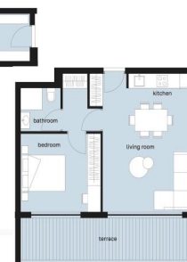
Flats 104/204 Kitchen/Living 33.4m 2 Bedroom 12.025m 2 Bathroom/Laundry 6.1m 2 Covered veranda 17m 2