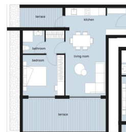
Flats 104/204 Kitchen/Living 34.86m 2 Bedroom 11.34m 2 Bathroom/Laundry 6.3m 2 Covered veranda 19.44m 2