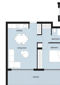
Flats 103/203 Kitchen/Living 33.4m 2 Bedroom 12.025m 2 Bathroom/Laundry 6.15m 2 Covered veranda 17m 2