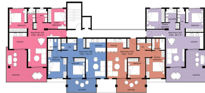
| +2 SECOND FLOOR