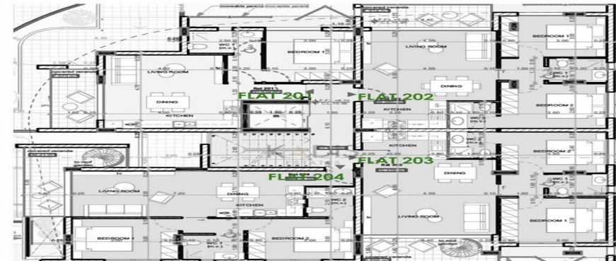
BUILDING A - SECOND FLOOR