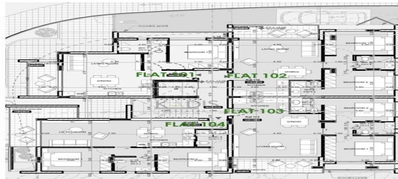
BUILDING A - FIRST FLOOR