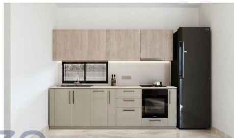
FLAT 103 - 203