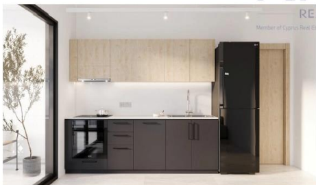
FLAT 104 - 204 - 107 - 207