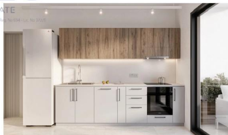
FLAT 105 - 205 - 106 - 206