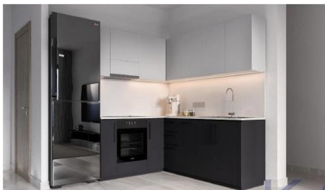
FLAT 101 - 201 - 102 - 202