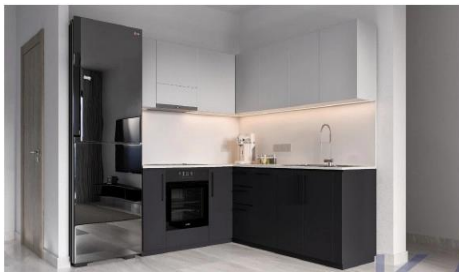
FLAT 101 - 201 - 102 - 202