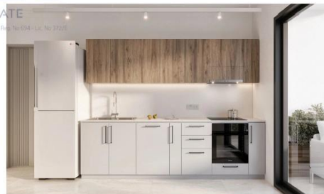
FLAT 105 - 205 - 106 - 206