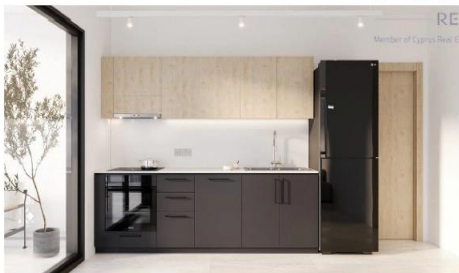
FLAT 104 - 204 - 107 - 207