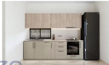
FLAT 103 - 203