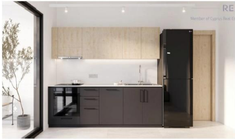
FLAT 104 - 204 - 107 - 207