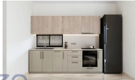
FLAT 103 - 203