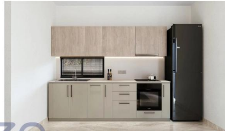
FLAT 103 - 203