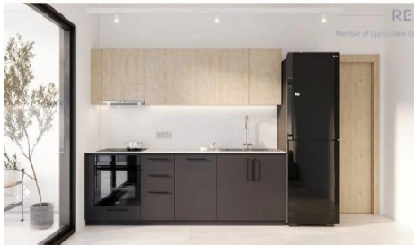
FLAT 104 - 204 - 107 - 207