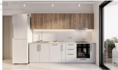
FLAT 105 - 205 - 106 - 206