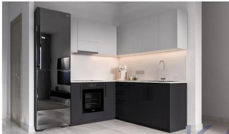
FLAT 101 - 201 - 102 - 202