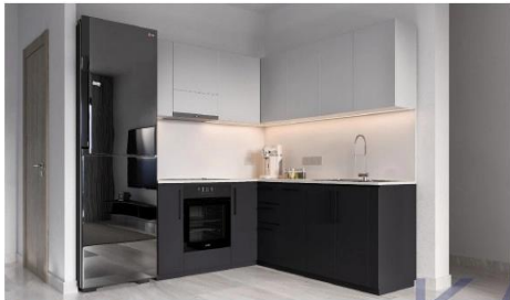
FLAT 101 - 201 - 102 - 202