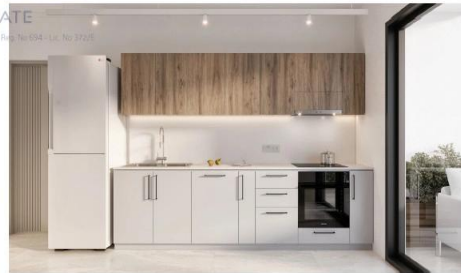
FLAT 105 - 205 - 106 - 206