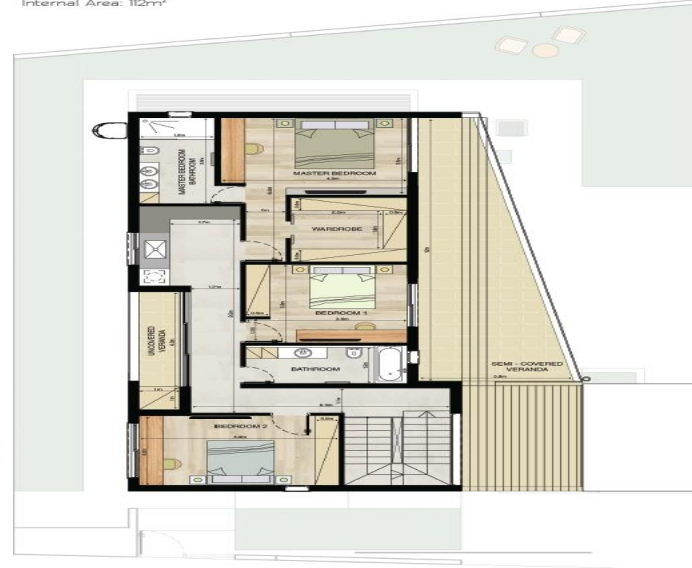
First Floor Internal Area: 112m 2