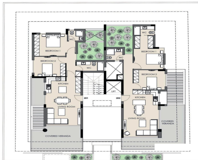
FLOOR PLANS SECOND FLOOR