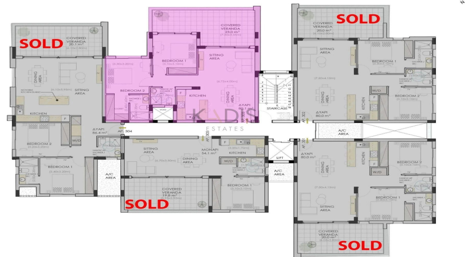
BLOCK B - THIRD FLOOR PLAN 1 : 100