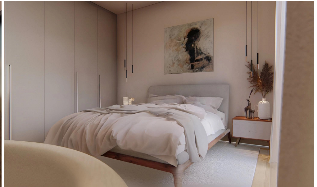
block K 1st floor