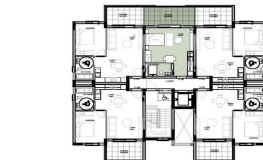
apartment Q - 103 location