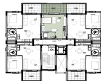
apartment Q - 303 location