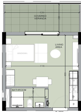
apartment Q - 303 layout plan