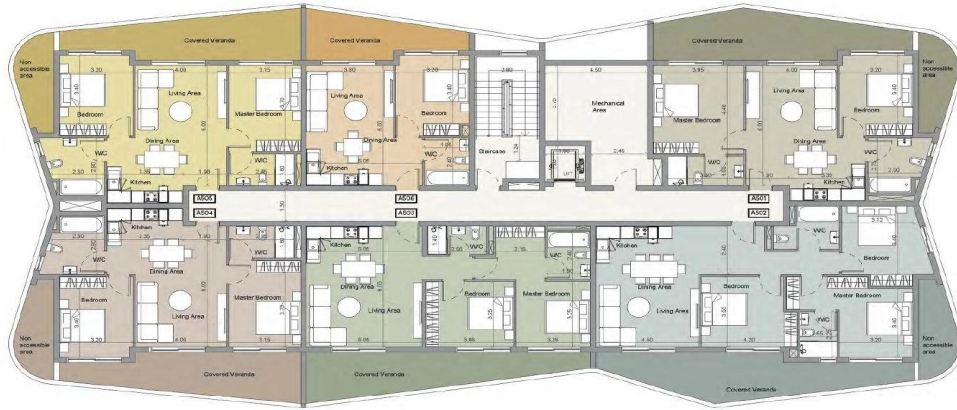
5th FLOOR PLAN