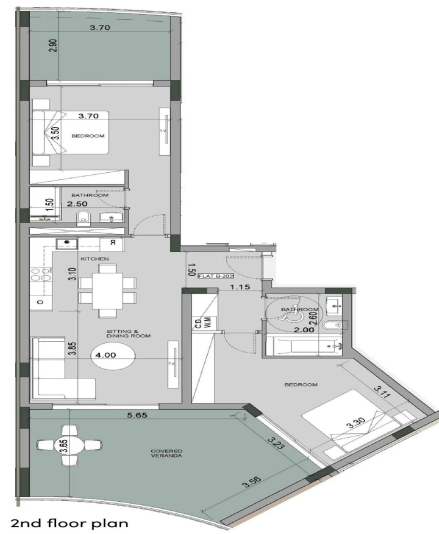
• block a floor 2