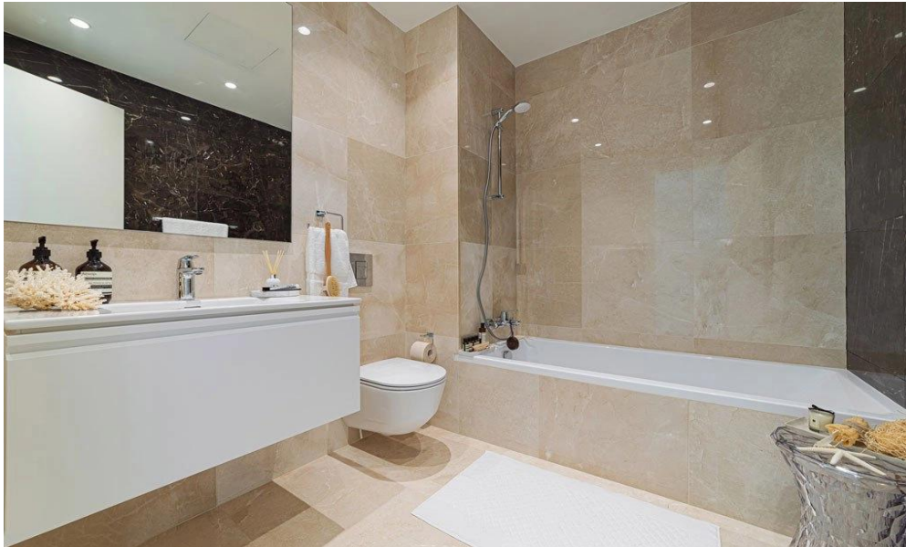
block B apartment 203