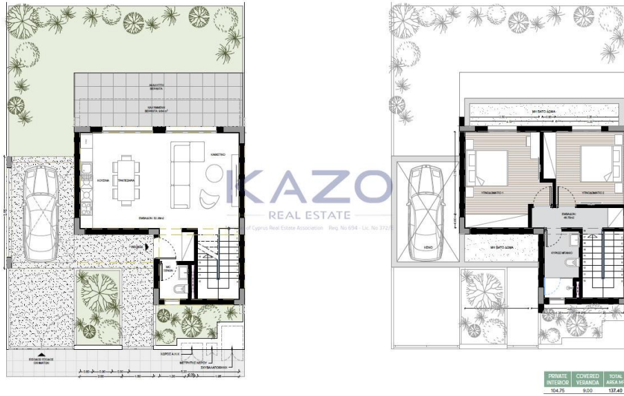
type A ground floor