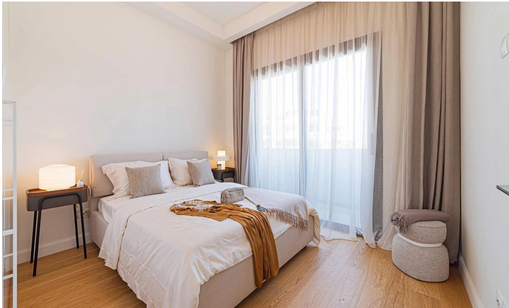
Villa Three-Bedroom H1