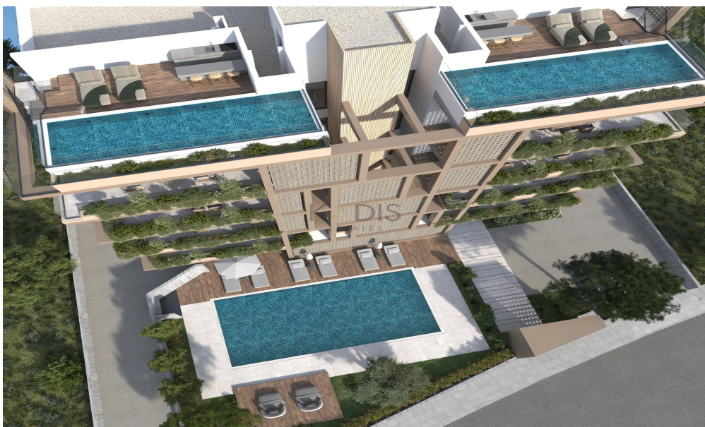
APARTMENTS 101 - 201 - 301