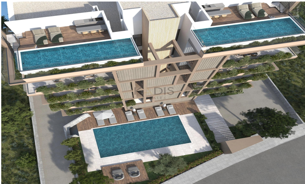
APARTMENTS 101 - 201 - 301