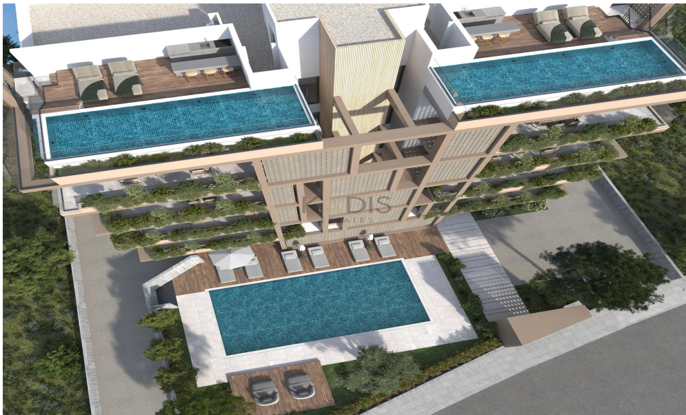
APARTMENTS 101 - 201 - 301