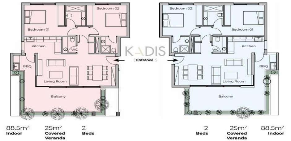
APARTMENTS 102 - 202 - 302