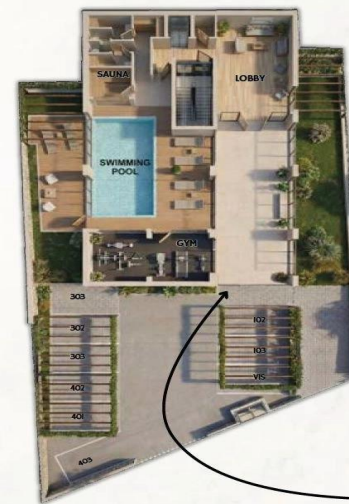
SOUTH ENTRANCE FLOOR 0