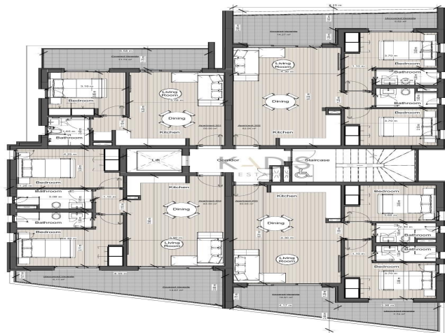
All furniture, fixtures, furnishings and decorative elements depicted in this architectural drawing are for illustrative purposes only and do not form part of the Contract of Sale, unless otherwise agreed between the Parties.