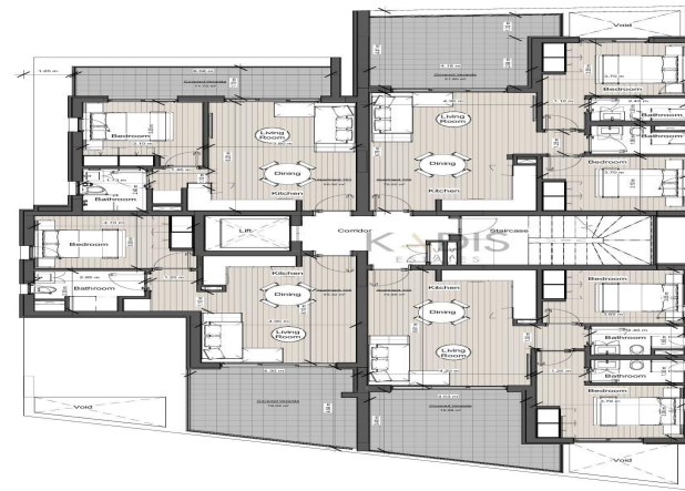
All furniture, fixtures, furnishings and decorative elements depicted in this architectural drawing are for illustrative purposes only and do not form part of the Contract of Sale, unless otherwise agreed between the Parties.