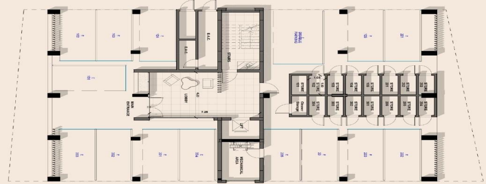
Parking, Lobby, Storage Rooms