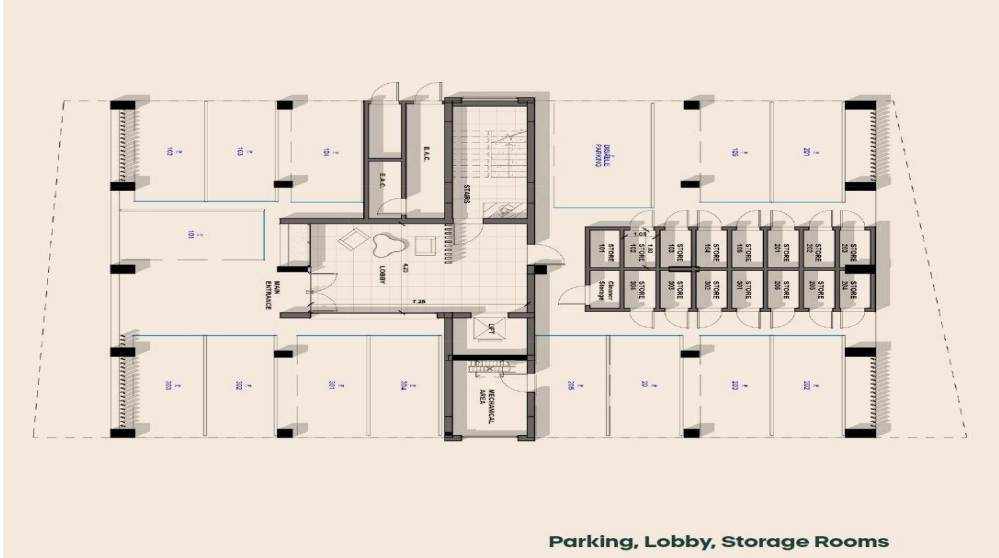
Parking, Lobby, Storage Rooms