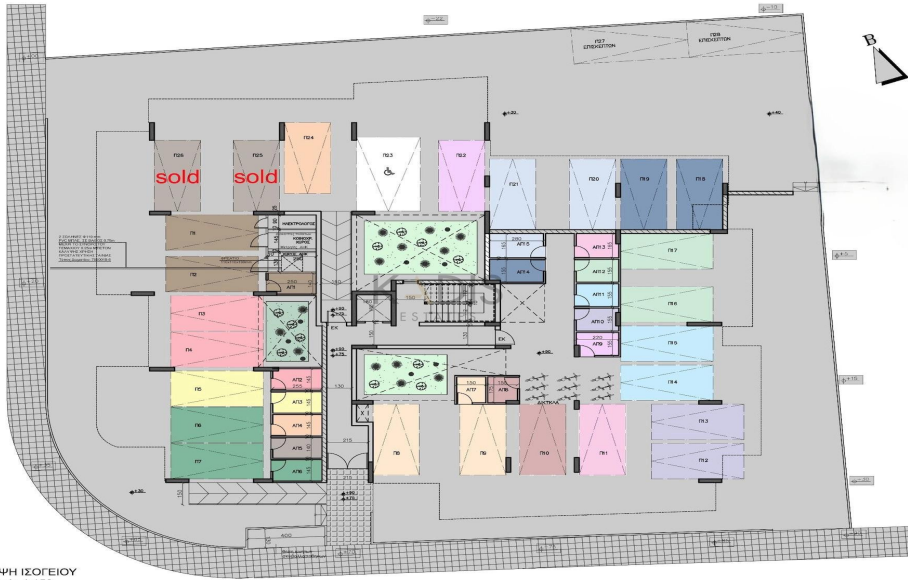
ΚΑΤΟΨΗ ΙΣΟΓΕΙΟΥ scale 1:150