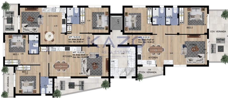
Typical Floor Plan - Block B