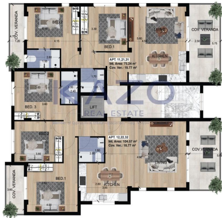
Typical Floor Plan - Block A