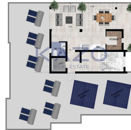
Roof Garden Plan - Block A