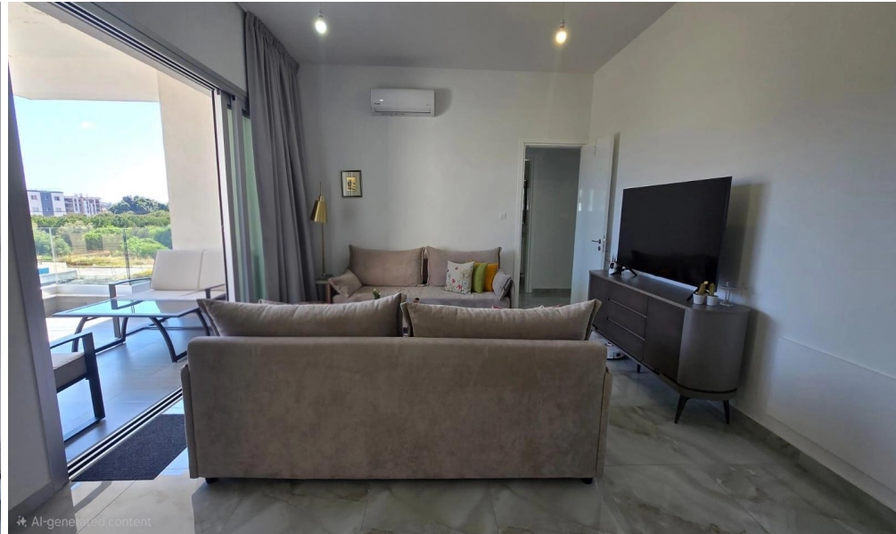
✦ AI-generated content