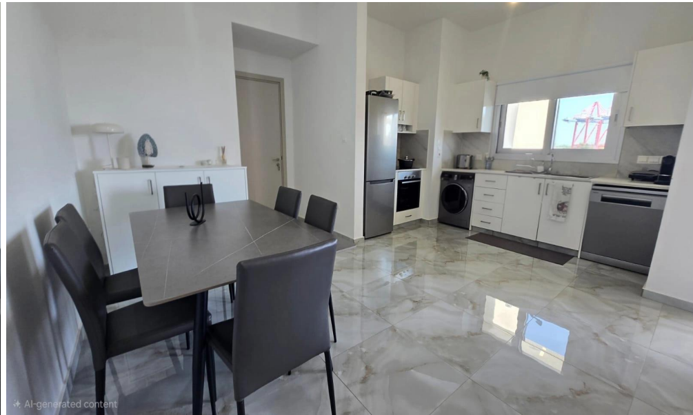
✦ AI-generated content