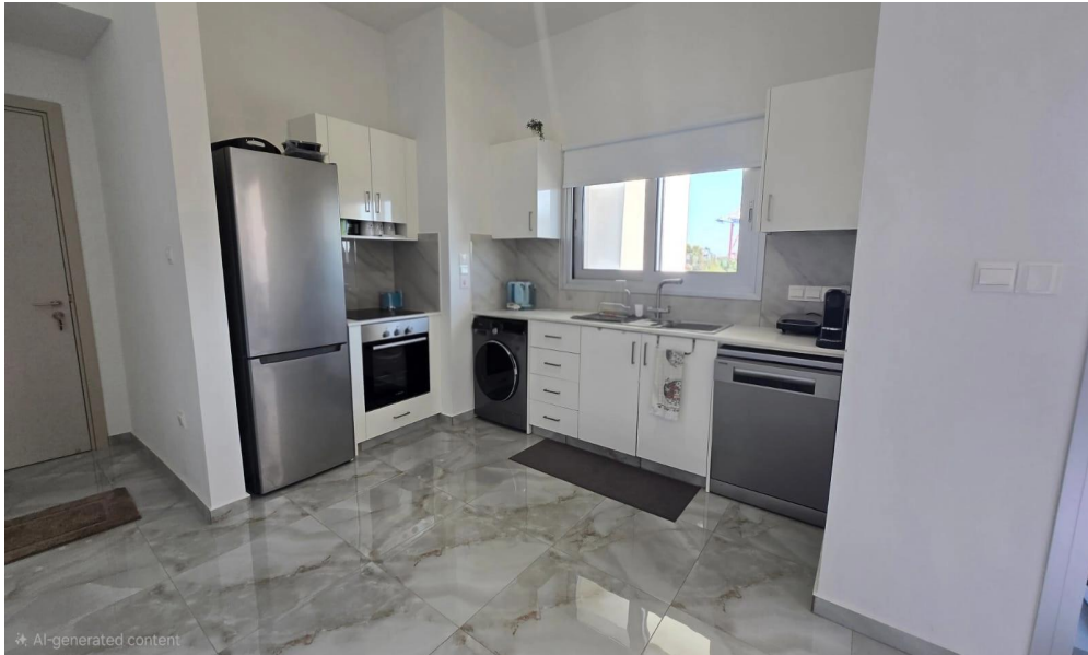
✦ AI-generated content