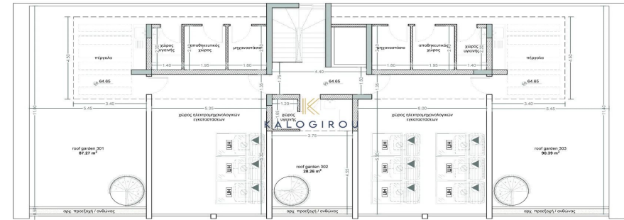
ODE RESIDENCE - ROOF GARDEN