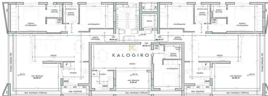
ODE RESIDENCE - 2ND FLOOR