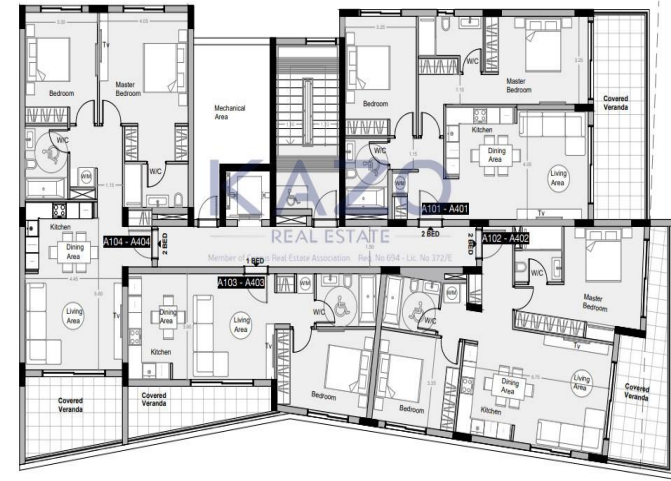
1-4 floors | block A