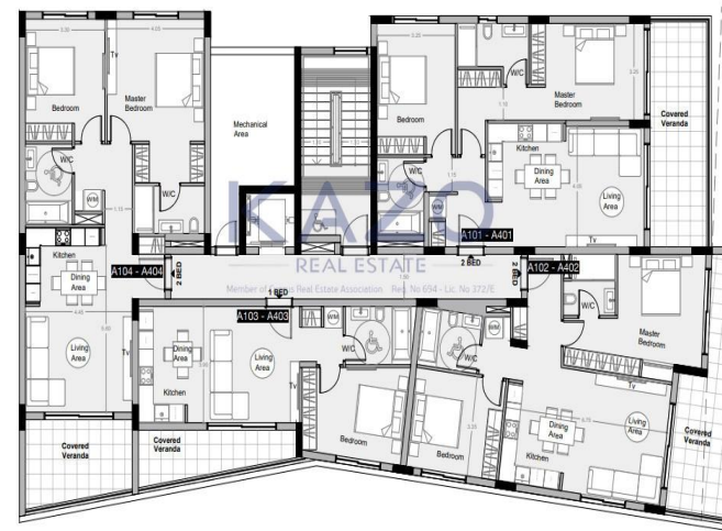
1-4 floors | block A