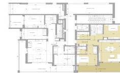
4th floor plan