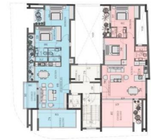
Typical floor two-bedroom apartment covered area 84/85 m 2 covered balcony 17/24m 2 1 storage 1 parking