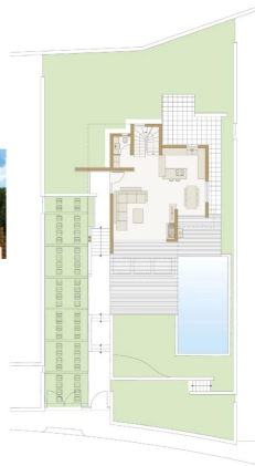
Landscape view - A5

For design A5S, the floorplans are the mirror image of those shown here.