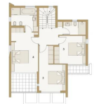
First floor - A5