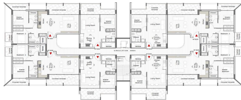
A003-BLOCK B SECOND FLOOR